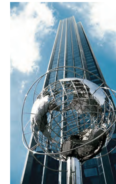
TRUMP INTERNATIONAL HOTEL & TOWER, NEW YORK