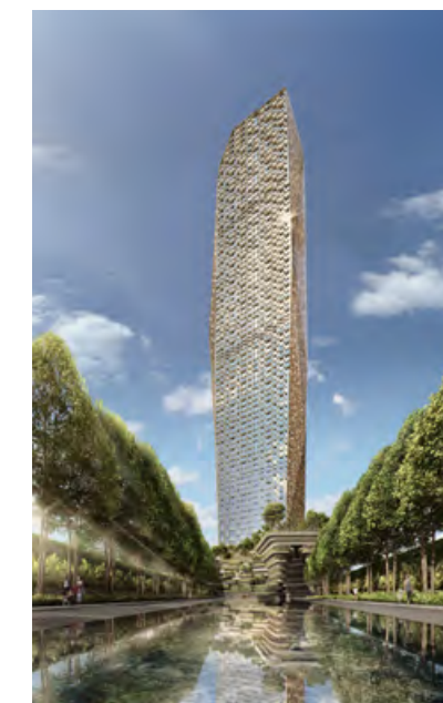
TRUMP TOWER MUMBAI, INDIA