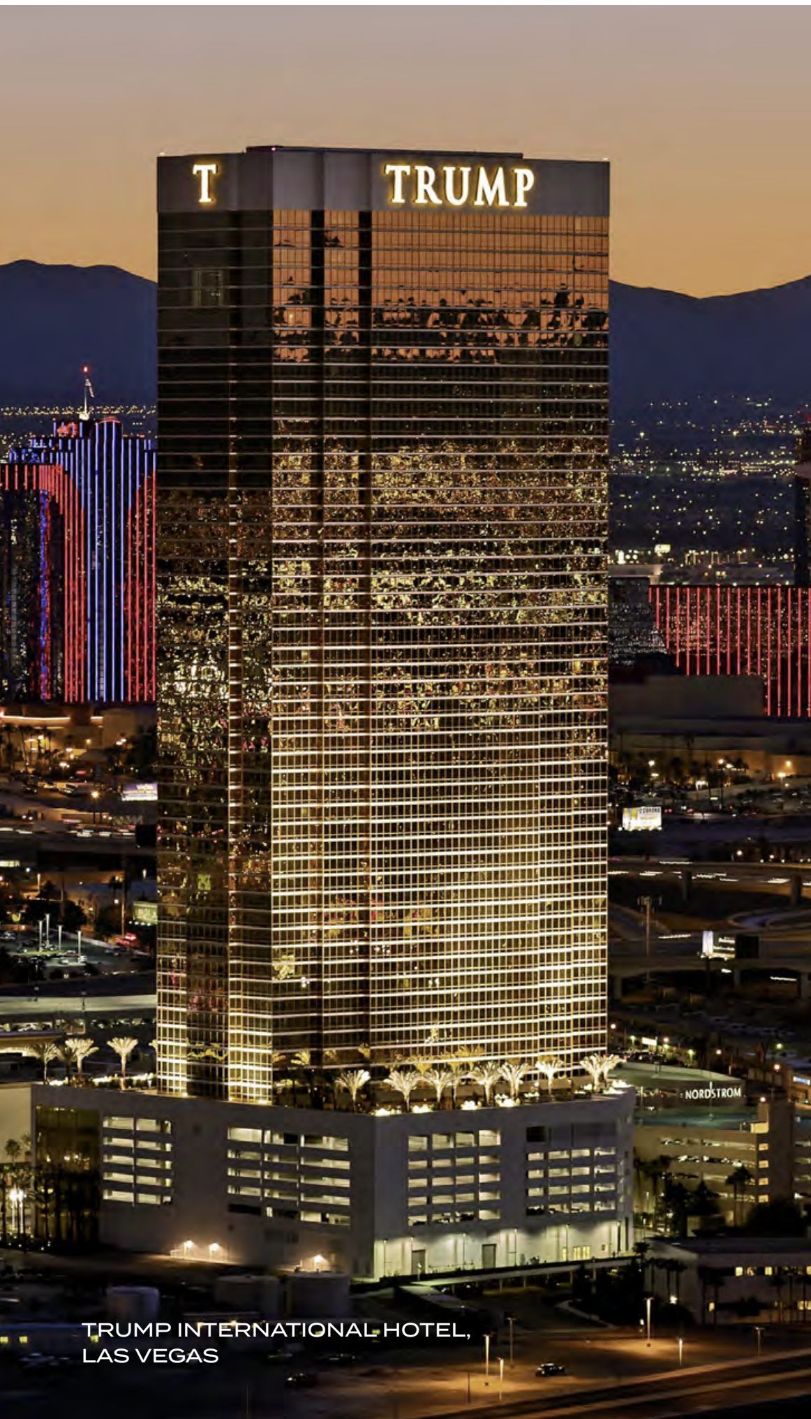
TRUMP INTERNATIONAL HOTEL, LAS VEGAS