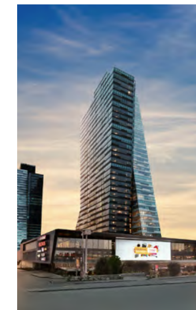
TRUMP TOWER ISTANBUL, TURKEY