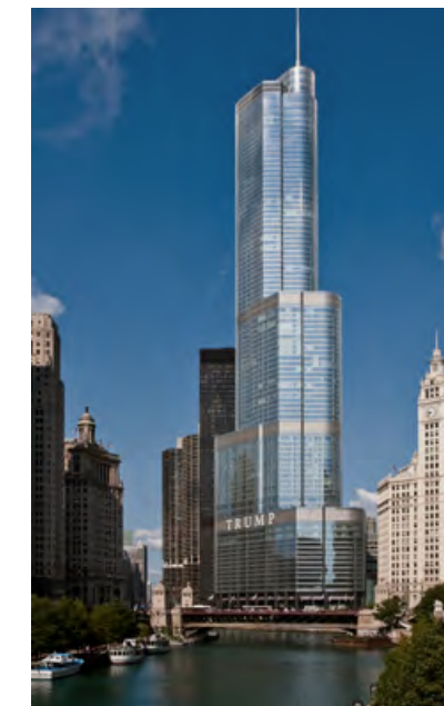
TRUMP INTERNATIONAL HOTEL & TOWER CHICAGO

Virtually no detail is overlooked. With each of its properties, Trump consistently continues to raise the bar for luxury living.