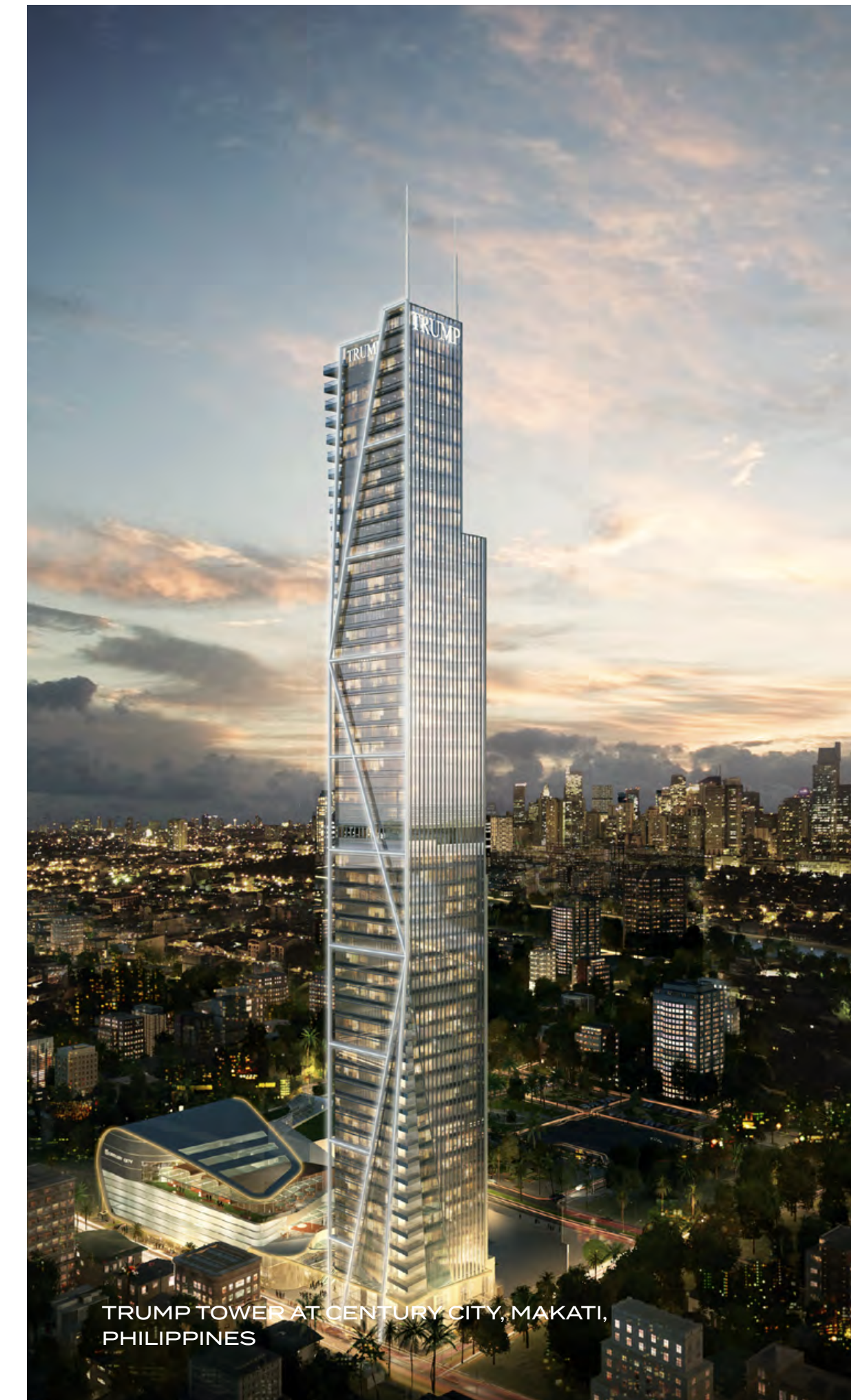
TRUMP TOWER AT CENTURY CITY, MAKATI, PHILIPPINES